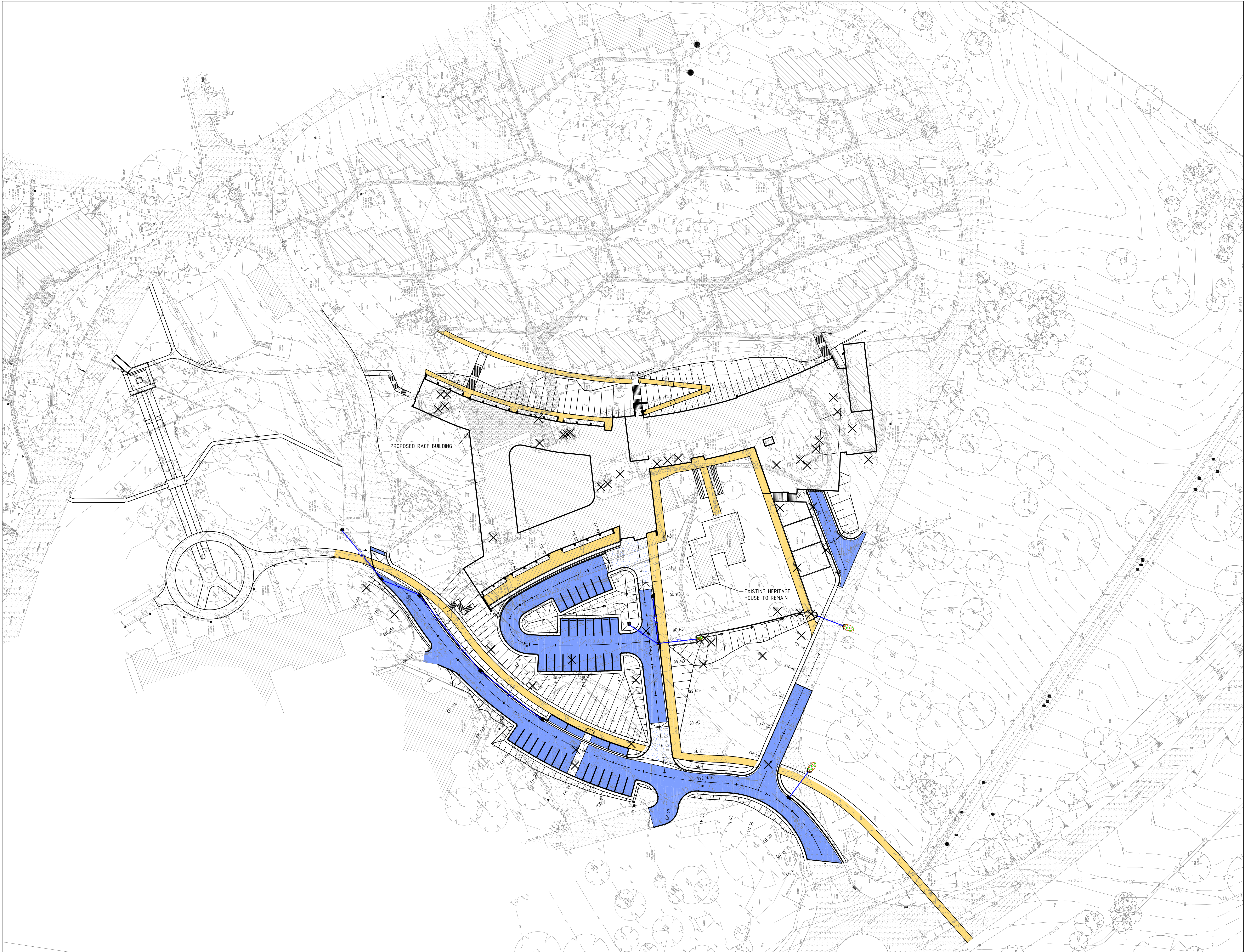
PLAN SCALE 1:500